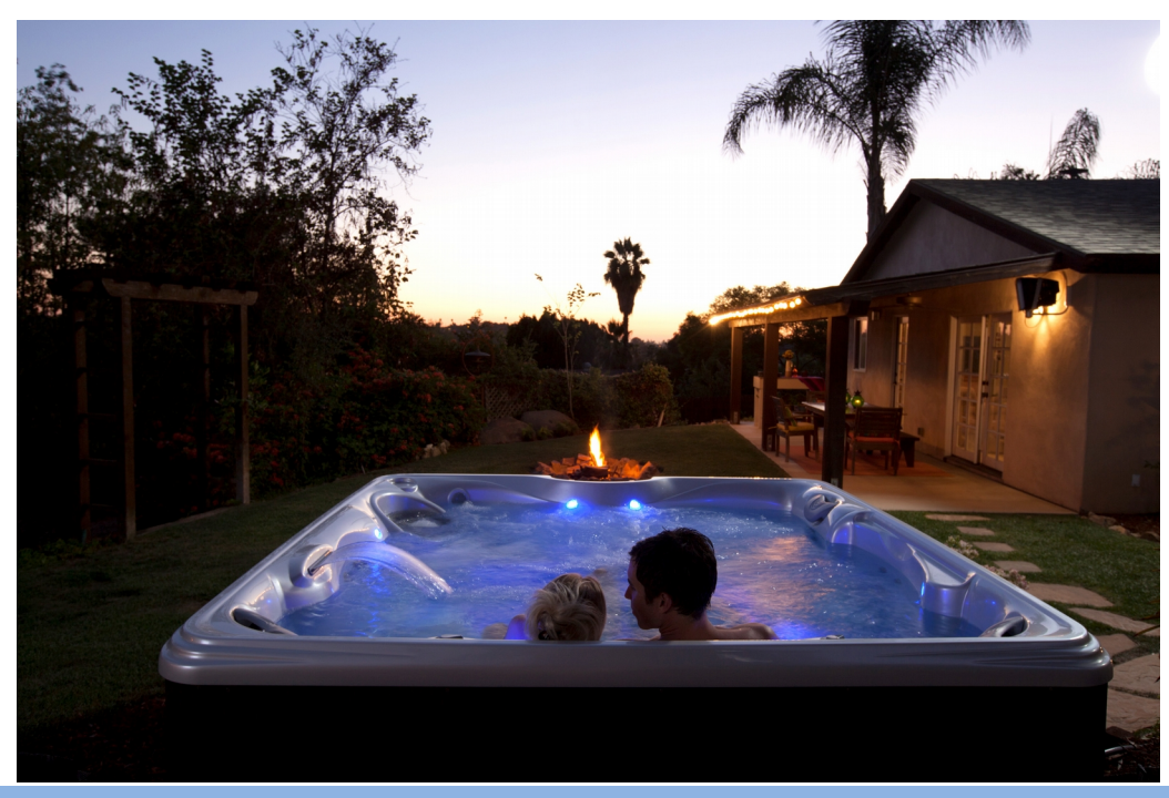
Report By: Branson Hot Tubs and Pools – Hot Tubs, Pools, and More! www.bransonhtp.com

likely extend the same to you if you choose to buy.